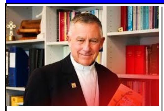
PASTORAL LETTER 15 February 2019