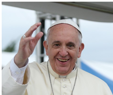
With his famous 'Buonasera,' His 1st Words as Holy Father: 'And now let us begin this journey'